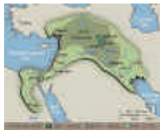
The Assyrian Empire.

The first known inscriptions of Aramaic date to the late tenth or early ninth century B.C. In a phenomenal wave of expansion, Aramaic spread over Palestine and Syria and large tracts of Asia and Egypt, replacing many languages, including Akkadian and Hebrew. For about one thousand years it served as the official and written language of the Near East, officially beginning with the conquests of the Assyrian Empire, which had adopted Aramaic as its official language, replacing Akkadian.